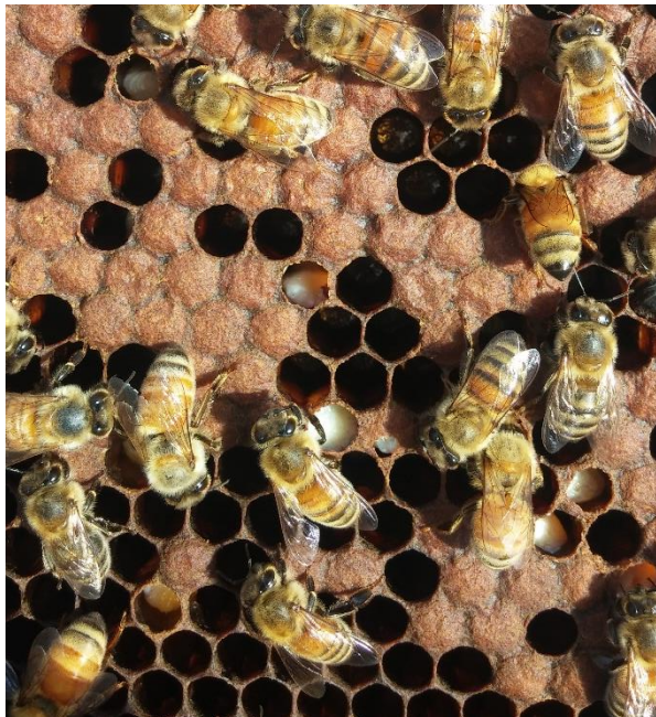
Colony with parasitic mite syndrome. This colony has a high population of mites. Note the sick, melted looking larvae. There is a very low chance that this colony could survive the stress of winter, even if varroa was controlled at this point.

Even with exponential growth it takes some time for varroa populations to get to dangerous levels. In the real world, they often grow all summer and peak right when winter bees are being raised (late summer / early fall). These winter bees have to survive a period of high stress, and can't handle the extra challenge of being bitten and filled with viruses. This is one of the reasons that varroa mites kill colonies so often in the fall/ early winter.